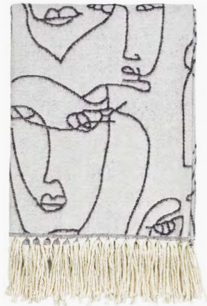
286539 White & Black Abstract Faces Throw

In the big picture of texture, pillows have the ability to add all that jazz. There is room for such diversity, personality and creativity, but at the end of the day, it either has to be soft enough to snuggle with or lively enough to pop.