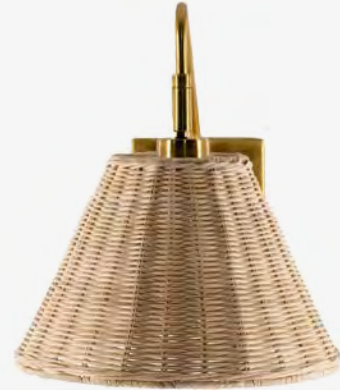
288558 Rattan & Gold Wall Sconce