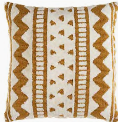
285989 Mustard & Ivory Geo Aztec Pillow