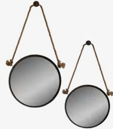
71311 Stuart Jute & Metal 2pc Mirror