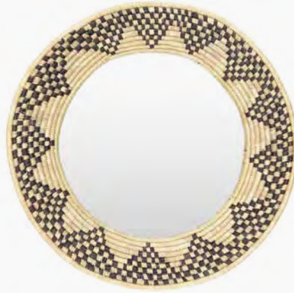
288563 Round Moonj Grass Wall Mirror