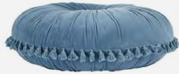
285762 Blue Velvet Floor Cushion Pillow