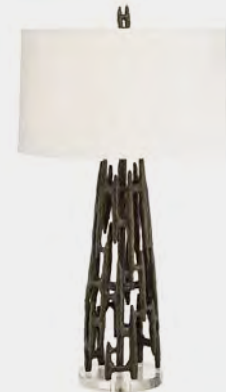
89023 Talise Black Table Lamp