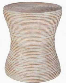
251173 Rattan Stool