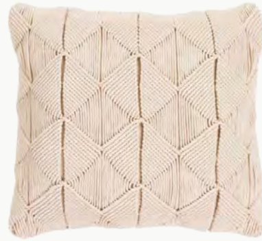
233268 Cream Macrame Diamonds Pillow