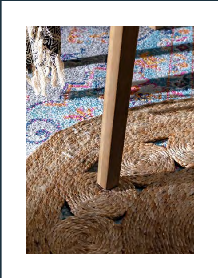
01. 277208 CAMILLA 6 Drawer Dresser 02. 282605 CREW Navy Outdoor Dining Chair 03. 234228 Wheat Medallion Round Jute Rug 3'