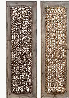
269819 Wood Framed Seagrass Wall Panel