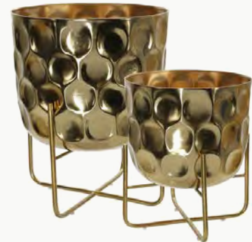
261776 Gold Hammered Planter 2pc Set